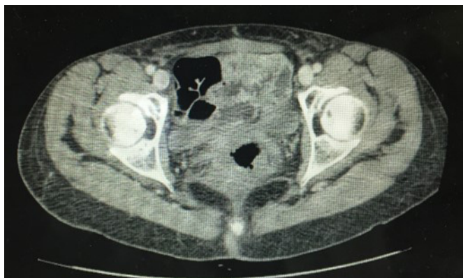
Figure 4: CT aspect after the lymphocele's regression.