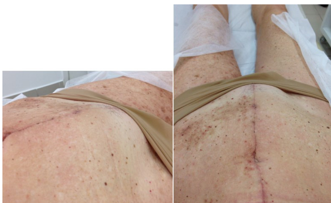
Figure 3: Pelvic aspect of the lymphocele.