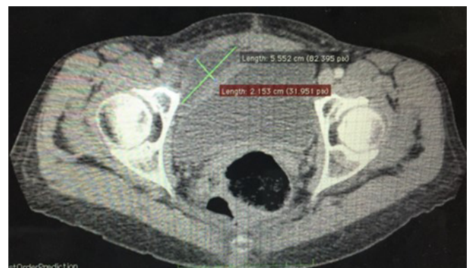
Figure 1: CT aspect of pelvic lymphocele.

Considering the pathophysiology of lymphocele, it can be argued that CDT, especially MLD may have contributed to the lymphocele enlargement after improvement of the lymph flow. It is important that oncology health professionals, lymphedema-trained clinicians and patients be informed about the side effects of the lymphedema treatment and be aware of this complications.